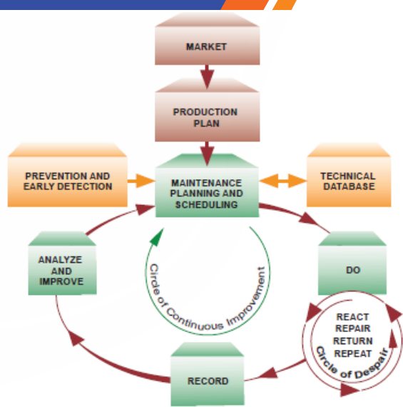
Results Oriented Reliability and Maintenance Cycle